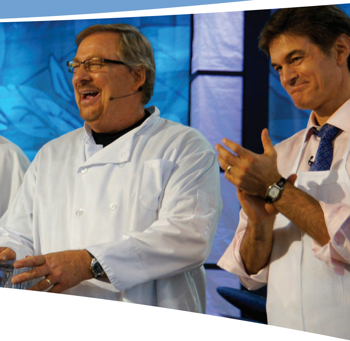
"Therefore, honor God with your bodies." 1 Corinthians 6:20b (NIV)