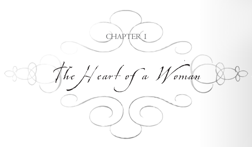
(Captivating, Chapter One)

s we begin this study together, know that it is a study of discovery . A journey, really. For you to discover who God meant when he meant you . What does it mean to be a woman? What is my calling in life? What does God value? What does He want from me? What do I want? And is that okay ?