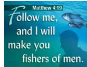
Key Verse Visual 5